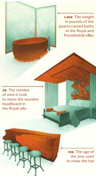
1,100: The weight in pounds of the quarry-carved baths in the Royal and Presidential villas

The best new hotels, from a Mexican hacienda with healing powers to a whimsical waterfront warehouse conversion in Hamburg